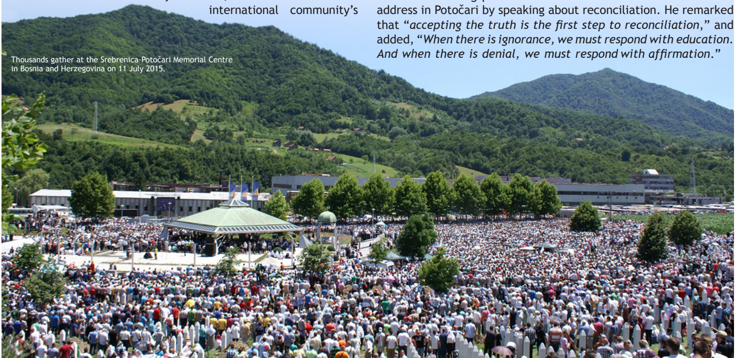
Thousands gather at the Srebrenica-Potočari Memorial Centre in Bosnia and Herzegovina on 11 July 2015.

Prosecutor Brammertz discussed the facts that have been proved by the Office of the Prosecutor, the importance of the victims to the justice process, and the need for continued attention and support to national prosecutions, support to victims, and the search for missing persons. Prosecutor Brammertz concluded his address in Potočari by speaking about reconciliation. He remarked that "accepting the truth is the first step to reconciliation," and added, "When there is ignorance, we must respond with education. And when there is denial, we must respond with affirmation."