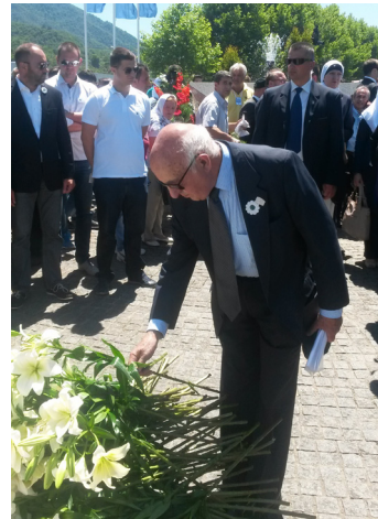
ICTY/MICT President Theodor Meron

ICTY President Judge Theodor Meron and ICTY Prosecutor Serge Brammertz delivered remarks at the commemoration as well. In his speech, President Meron quoted from the ICTY's appeal judgement in the case of Radislav Krstić - the first ICTY judgement to recognise the crimes committed at Srebrenica as genocide. "This is a crime against all of humankind," he said. "Its harm being felt not only by the group targeted for destruction, but by all of humanity." The President emphasised that this judgement, along with scores of others rendered by the ICTY, is a testament to the international community's