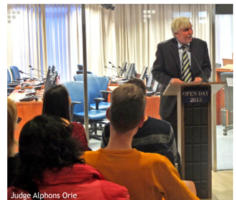
Judge Alphons Orié