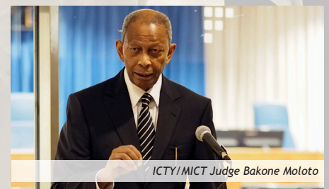
ICTY/MICT Judge Bakone Moloto