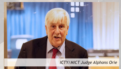
ICTY/MICT Judge Alphonse Orié