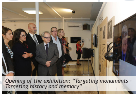
Opening of the exhibition: "Targeting monuments - Targeting history and memory"

During the conference, regional and international participants discussed key areas of the Tribunal's legacy, engaging in an active dialogue. Eight main panel discussions were held on topics such as: the normative legacy of the ICTY and its influences on national jurisdictions; the Tribunal's gender justice and non-judicial legacies; the Tribunal's operational legacy and how it can inform national prosecutions; the Defence and fair trials; the witness experience of testifying before the ICTY and local witness support mechanisms; and the historical value of the Tribunal's legacy. In addition to the panel discussions, the conference also hosted ten side events, including book launches, a documentary premiere, the opening of