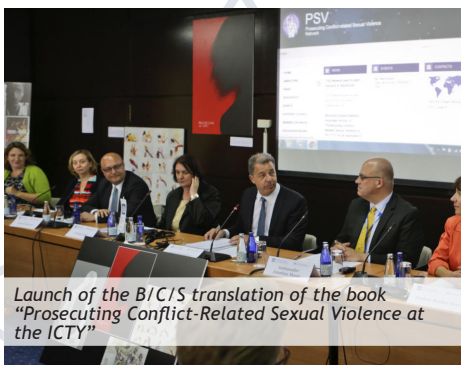
Launch of the B/C/S translation of the book "Prosecuting Conflict-Related Sexual Violence at the ICTY"